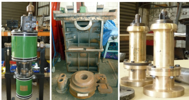
Over the page is the Westinghouse pump, cylinders and steam pressure valves.

You are advised that the details on the membership application form may be held on a computer file.