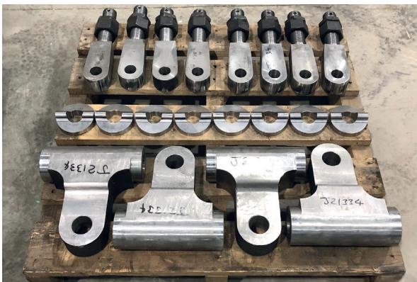
Spring Hanger Links

"Help get these parts in motion - support the 'Get on Track' Fund"